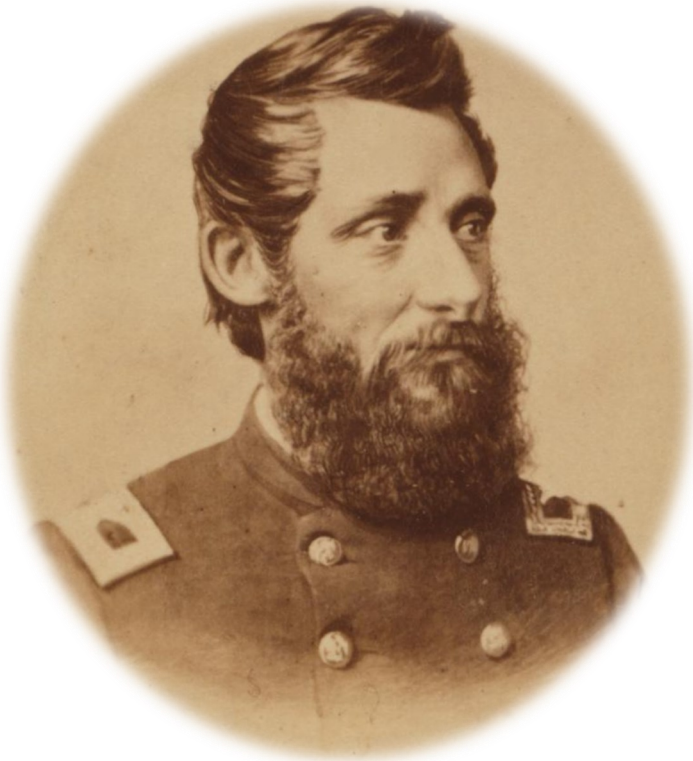
Benjamin H Grierson